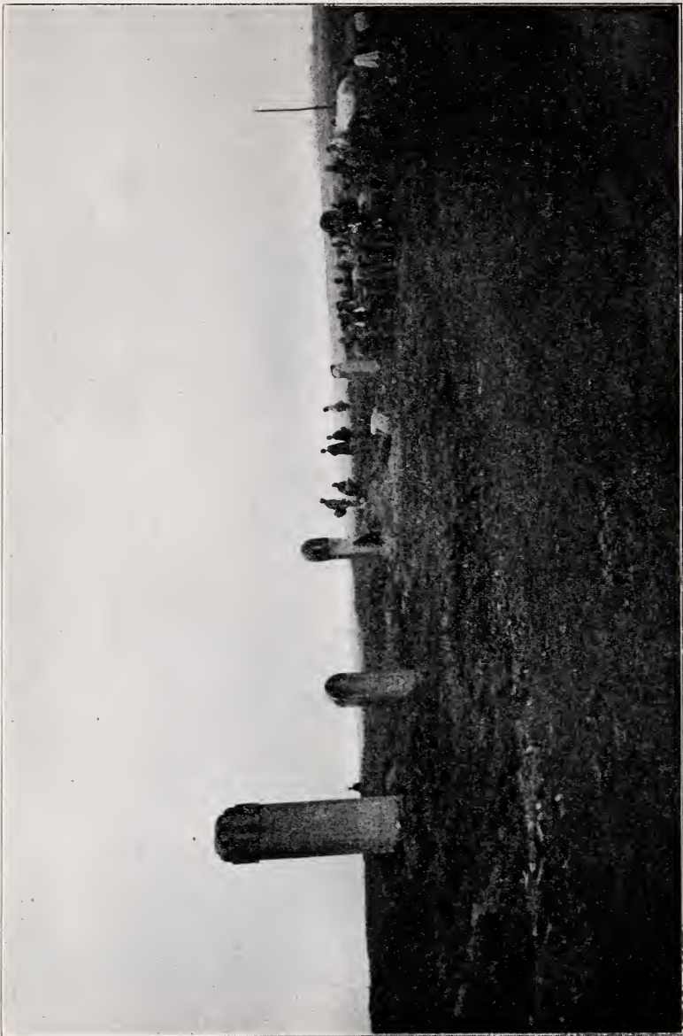
REMOVAL OF THE ORIGINAL NESTORIAN TABLET, OCTOBER, 2, 1907.

quite a good deal of the stone and had a shed erected to protect it some time ago"; but I am afraid the honorable gentleman would